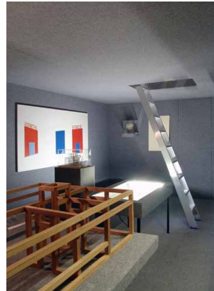
CIT.CIT.2 Platform & Treasury, 2005 Etablissement d'en Face, Brussels

of the collection. Hence, when he became director of the S.M.A.K. in Ghent, he invited the artist to do 'something' with the museum's collection. That finally resulted in Museum for a Small City in 2013, an ambitious project on the crossroads between curating and exhibition design. The starting point was the S.M.A.K. collection and its archived history, whereas the title was linked to an eponymous, unrealised project by Mies van der Rohe. "When browsing on the Internet, I saw a picture of a drawing proposal that van der Rohe made for an imaginary museum in the 1950s. On the drawing, the building itself is reduced to almost nothing. There is just the suggestion of a floor and a supporting structure. It looks like an endless landscape in which he placed, by means of a collage, some artworks, like obstructing elements." One of the works depicted in van der Rohe's sketch is Picasso's Guernica . It reminded Venlet of Picasso's Guernica in the Style of Jackson Pollock (1980), a painting by Art & Language in the S.M.A.K. collection. Venlet borrowed the title of his exhibition from van der Rohe's proposal. He devised a kind of stage on which to show works from the collection in different constellations. The intervention consisted of a large floor surface covered in grey carpet tiles. It was one step higher than the museum floor and was assembled in a large grid pattern. It looked rather like a chessboard, with the works from