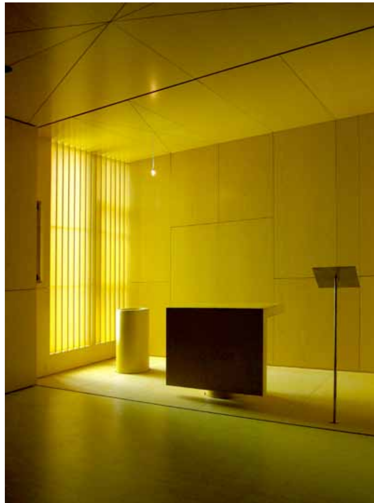
Chapel and Quiet Room, 2009 (1/2) AZ Groeninge, Kortrijk, Belgium