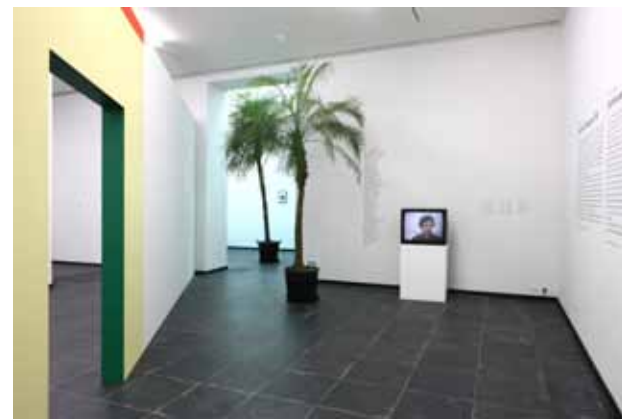
Art in Europe after 1968, 2015 S.M.A.K., Ghent, Belgium