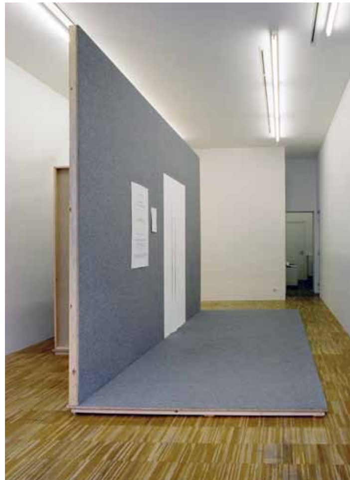
CIT.CIT.1 Image bank, 2005 Gallery Jan Mot, Brussels