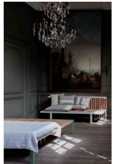
Een Meubel is ook een Huis Curated by Katrien Vandemariere © Design museum Gent